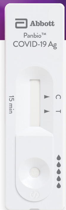
Panbio™ COVID-19 Ag Rapid Test Device